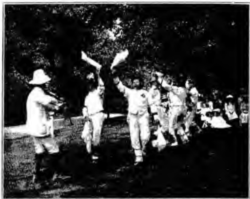
THE HAMPTON MORRIS SIDE